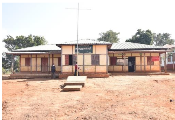
The existing school building

Zar Li Village, Thayet Kon Village Tract, Naunghkio Township, Kyaukme District