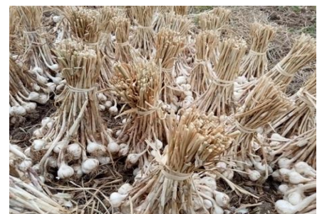
Kone Kyaung Village