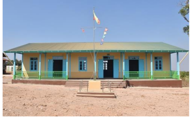
New school building constructed