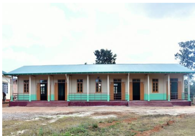
New school building constructed