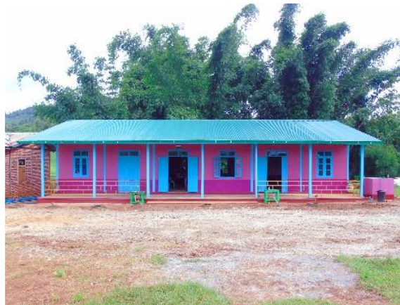
New School Building