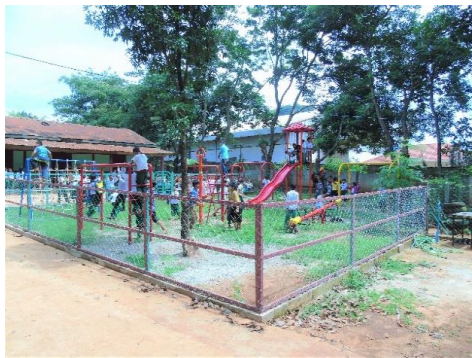
NII-26 Nam Khaik BEPS