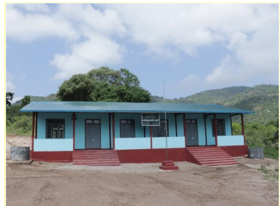
The existing school building