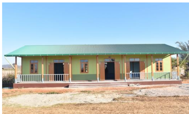
New school building constructed