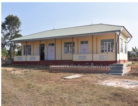
The existing school building

Shauk Chone Village, Kan Gyi Village Tract, Naunghkio Township, Kyaukme District