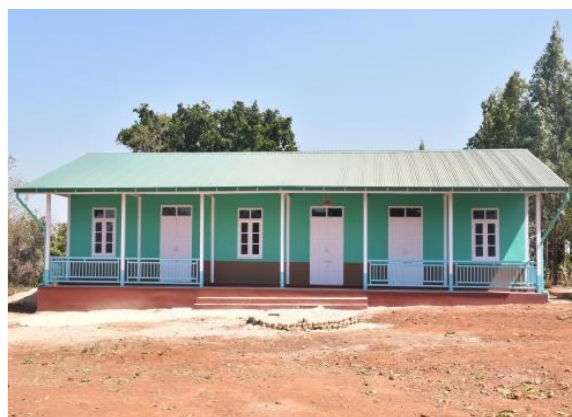
New school building constructed