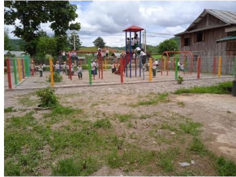
NIV-24 Pan Meik BEPS