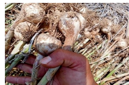
Kone Nyunt Village