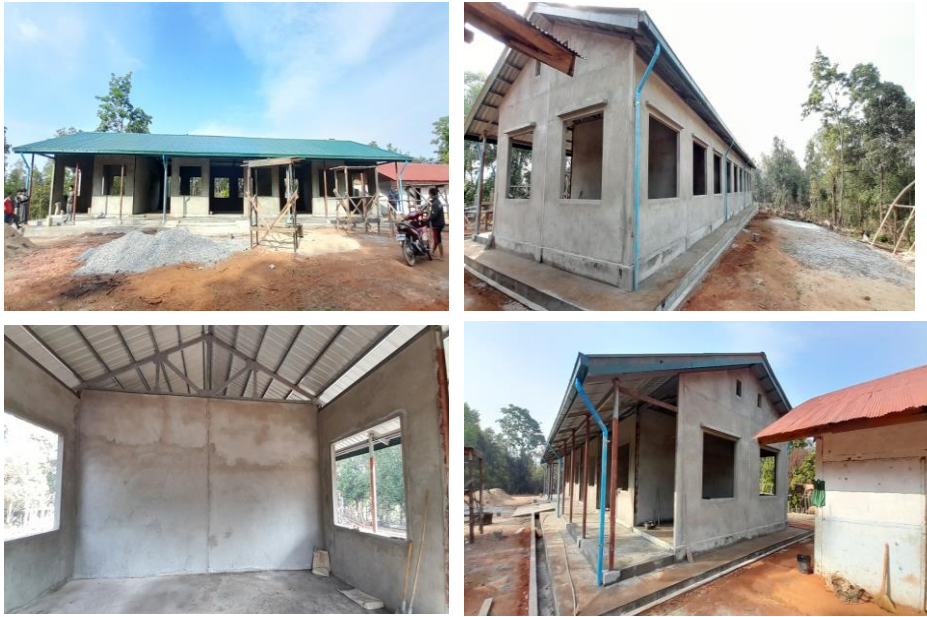
21 March 2023 latest progress photos