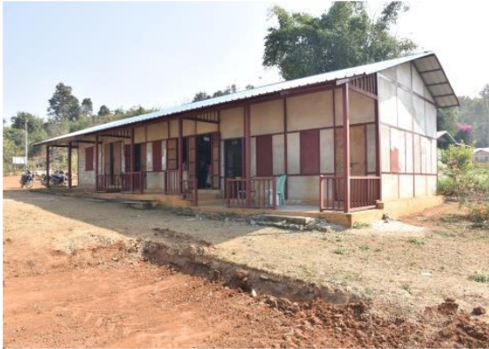
The existing school building

Set Yon Village, Lon Yon Village Tract, Naunghkio Township, Kyaukme District