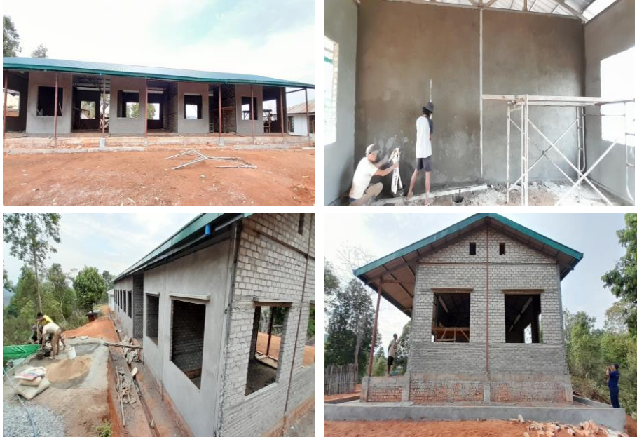
20 March 2023 latest progress photos