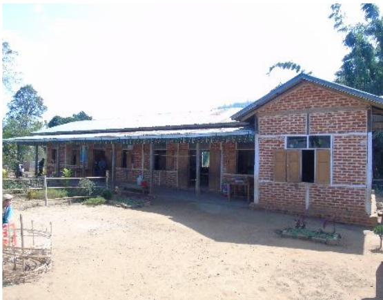
Old School Building