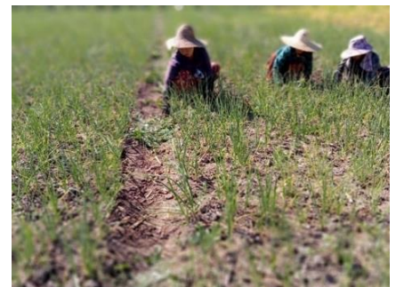
Naung Ae Taung Village