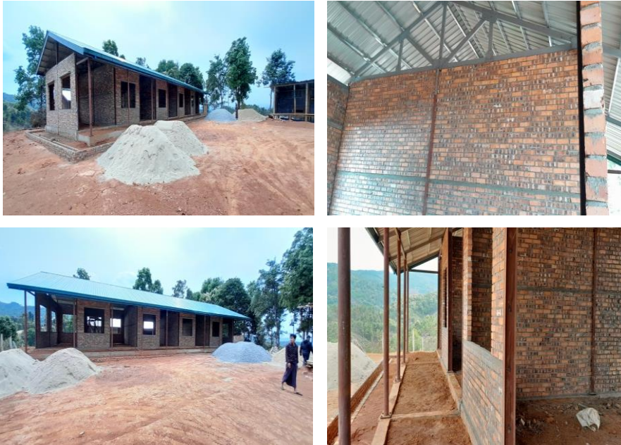
21 March 2023 latest progress photos