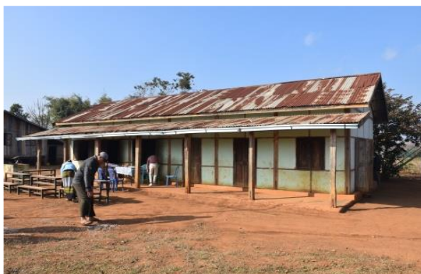
The existing school building

Ho Naung Village, Upper Kyu Inn Village Tract, Naungkhio Township, Kyaukme District