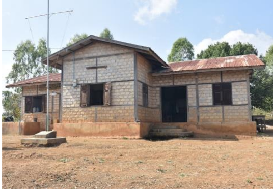
The existing school building

Ngar Pin Village, Than Bo Village Tract, Naungkhio Township, Kyaukme District