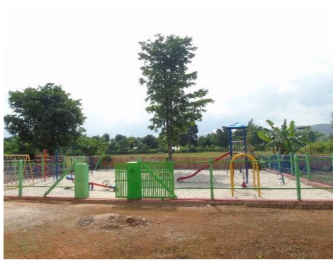
NII-44 Sanpya Shwegu BEMS