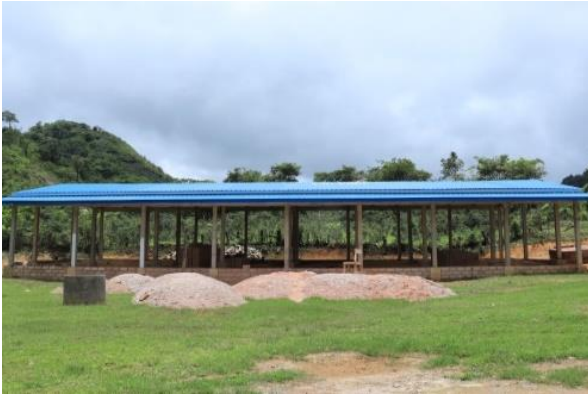
Uncompleted school building

Nar Thun Village, Yan Twin Ngar Kyaung Village Tract, Yat Sauk Township, Taunggyi District