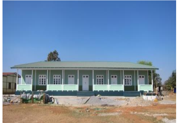
New school building constructed