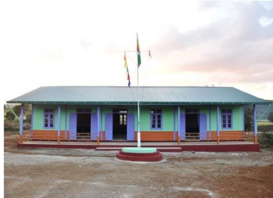
New school building constructed